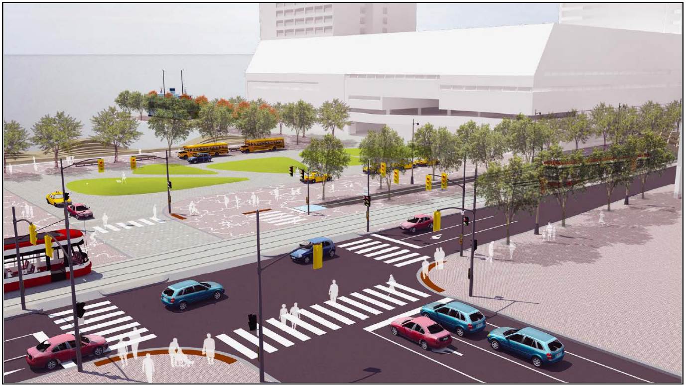
Figure 5 – Artist's depiction of typical Queens Quay East street cross-section with at-grade streetcar extension. Proposed alternate tunnel portal and Yonge Street Slip fill-in also shown.