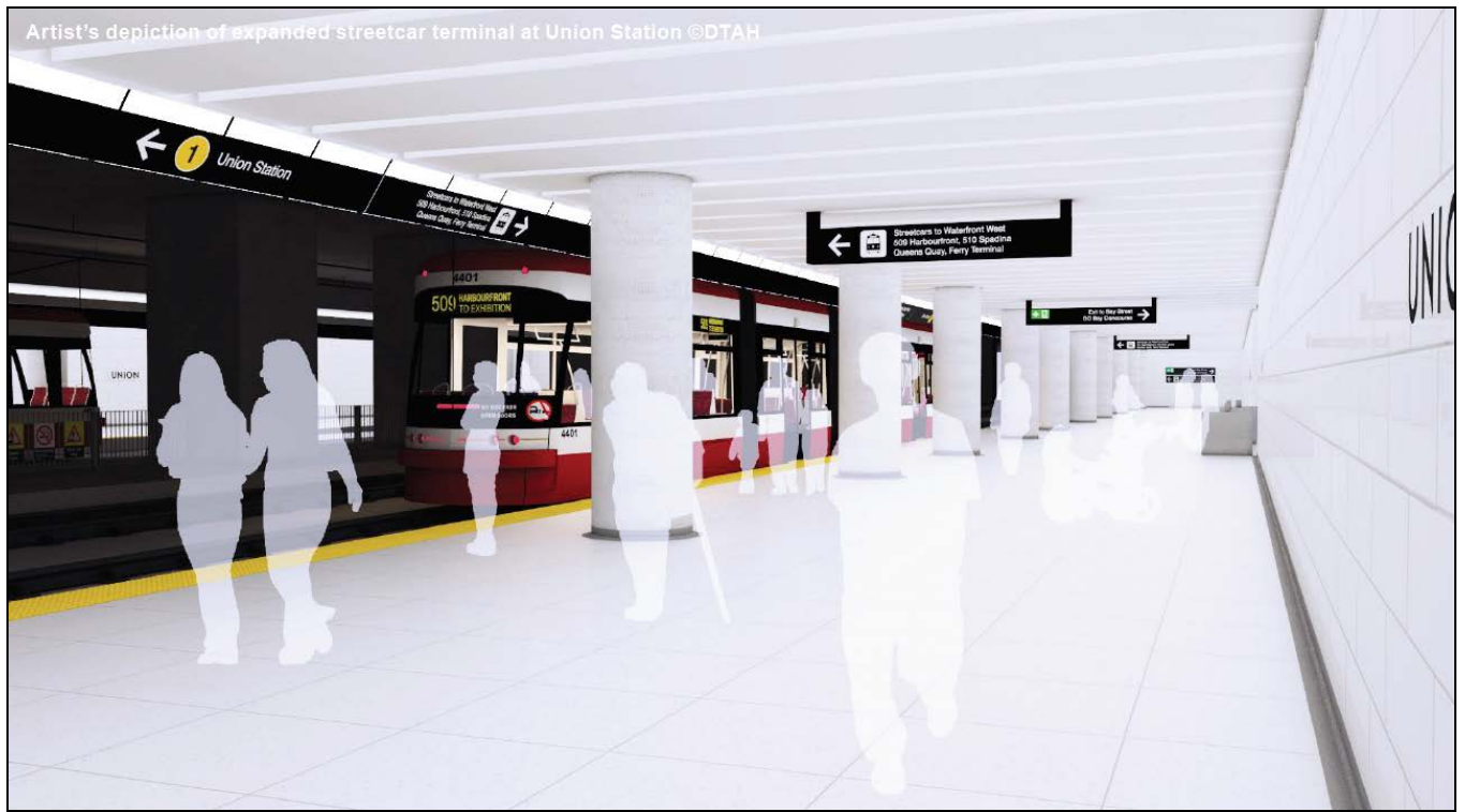
Figure 3 – Artist's depiction of expanded streetcar terminal at Union Station.