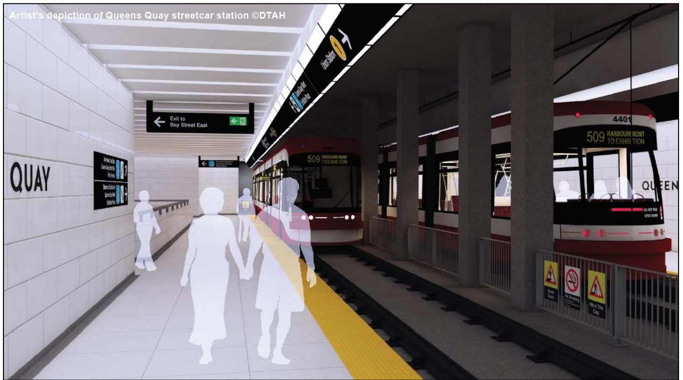
Figure 4 – Artist's depiction of expanded Queens Quay Station.